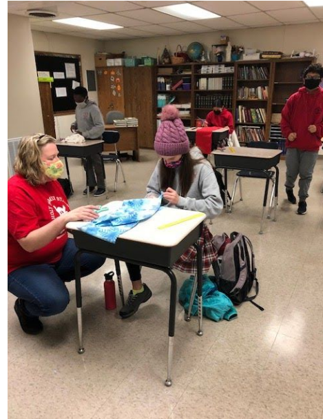
Sixth Grade working on the scarf service project.